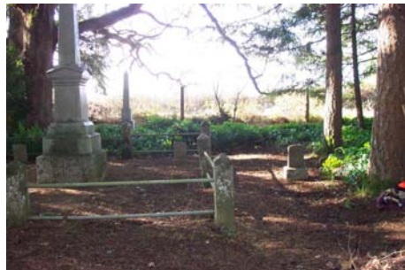
Above: "After" shot which shows the results of the hard work on Nov 7.